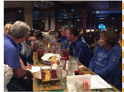
Forever Royals Fans in Their Colors

"It was a totally relaxing evening enjoyed by all probably because we didn't have to cook!"